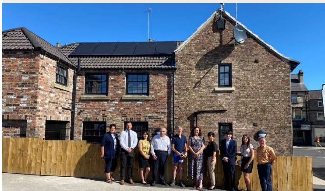
Ryedale District Council celebrates successful conversion of former Norton pub into eight flats